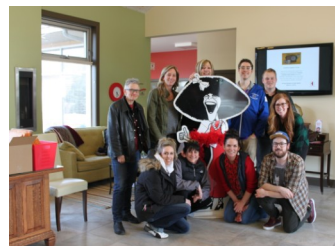
Staff from Busch Systems coming in to help tidy up around the Clubhouse!