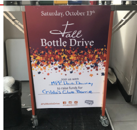
Bayfield Street Beer Store Bottle Drive