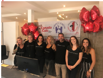
i.d. Hair Studio participating in Canada Cuts for GCSM

From bake sales and bottles drives, haircuts and bingo nights, to golf tournaments, concerts, garage sales and more, you can turn anything into a fundraiser for Gilda's Club Simcoe Muskoka. We call them Do It Yourself, or DIY Fundraisers , and since Gilda's Club does not receive any government funding, the money raised through DIY Fundraisers has a significant impact on meeting our fundraising goal each year. Planning a DIY Fundraiser to benefit Gilda's Club can be an exciting and rewarding experience to get everyone involved! Whether you are a business looking to align your brand with Gilda's Club Simcoe Muskoka, or a community member or organization who has a fundraising event idea, don't hesitate to contact us. For more information on how you can get started on your DIY Fundraiser, please contact the Clubhouse at 705-726-5199 or admin@gildasclubsm.org .