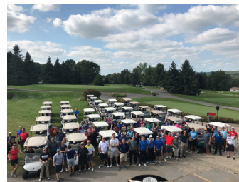
Huron Ontario CPA Assoc. golf tournament