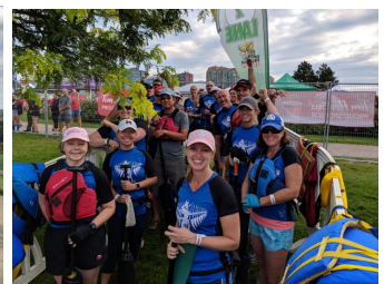
Team Powerstrokes at Barrie Dragonboat Festival