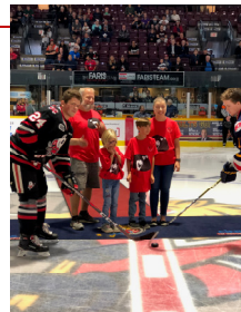
Gilda's Game Night with the Barrie Colts