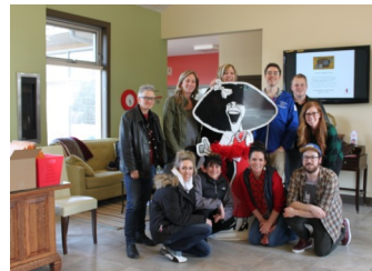
Staff from Busch Systems coming in to help tidy up around the Clubhouse!