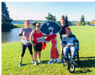
Honda Waterfront Marathon