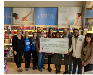
Shoppers Drug Mart